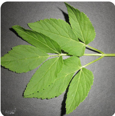
Goutweed leaf with common solid-green colour.

For anyone who has dealt with goutweed in their garden, they likely know what a daunting task this can be. If you are fortunate enough not to have goutweed on your property, it is a great opportunity to prevent its introduction and the introduction of any other invasive species.