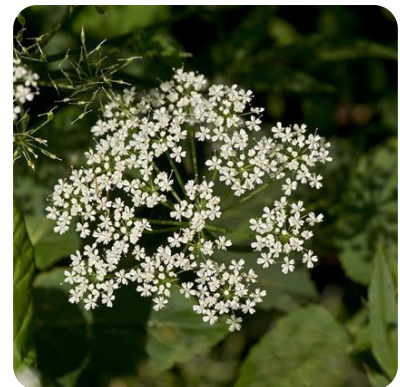
Goutweed flowers resemble members of the carrot family.