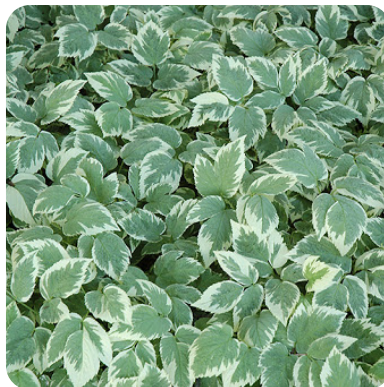
Goutweed leaf with common solid-green colour.